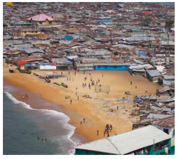
West Point, a township in Monrovia, Liberia, where Ebola spread rapidly through the densely-packed slums.

People spoke of the thousands of health volunteers and community initiatives that have been at the heart of tackling Ebola, many of which received active local government support. This is seen as a new network that could be built upon in the future. People are calling for continued support for these community initiatives, both to help eradicate Ebola, and to ensure they are at the heart of the recovery.