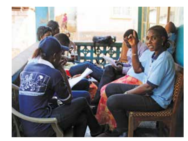
Focus group of community health workers in Thunder Hill, Sierra Leone, February 2015.

This report is based on interviews and focus group discussions that Oxfam conducted in Liberia and Sierra Leone in February 2015. In Sierra Leone, 23 focus group discussions and 30 individual interviews were conducted across both urban and rural parts of Western Area and Koinadugu district. In Liberia, 10 focus groups and 18 interviews were conducted in New Kru Town, Clara Town and West Point, Montserrado. In Liberia, Oxfam also conducted a survey to assess the economic impact of Ebola. This was carried out in December 2014 and involved 1,600 people from Montserrado, Nimba and Grand Gedeh counties.