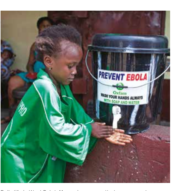
Daily life in West Point, Monrovia, an area that was severely affected by the Ebola outbreak.