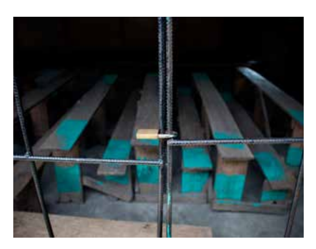
A school in West Point, Monrovia which has been shut during the Ebola outbreak.

A clear programme for the rehabilitation of schools is necessary, including improvement of facilities and continued awareness of good hygiene practices. Parents want desperately to send their girls and boys back to school to get the quality education that they need, but there are fears that schools may not be safe. The universal drive to give children a brighter future has been intensified for many people – as they have seen the damaging consequences of school closures, including a rise in teenage pregnancies. From listening to communities, Oxfam heard various reasons for this, including girls being driven to prostitution after their parents had died.