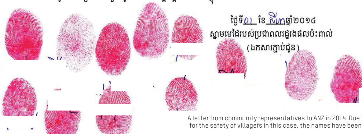
A letter from community representatives to ANZ in 2014. Due to concerns for the safety of villagers in this case, the names have been whited out.

សូមលោកប្រធានទទួលនូវការគោរពដ៏ខ្ពង់ខ្ពស់អំពីយើងខ្ញុំ។