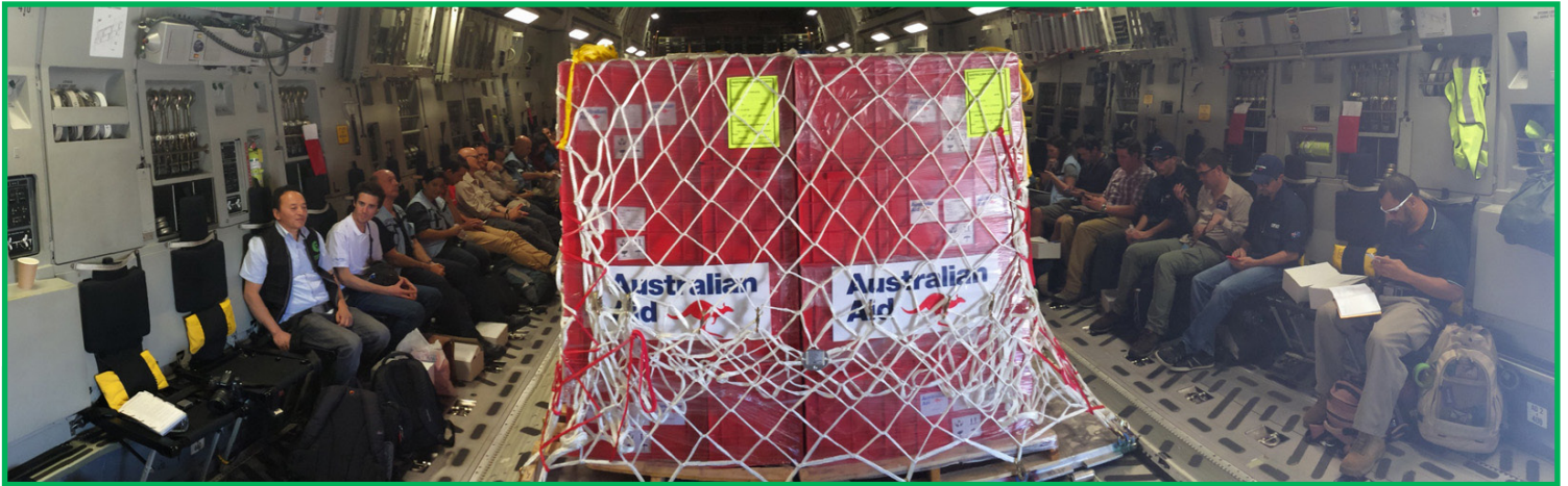
Figure 4: Oxfam Australia Humanitarian Emergency responders fly to Vanuatu on an Australian Government plane with aid supplies, following Cyclone Pam in March 2015