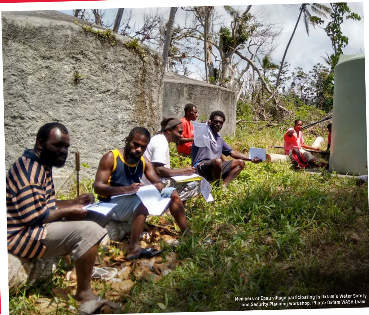
Members of Epau village participating in Oxfam's Water Safety and Security Planning workshop.

It is evident how access to essential services and resources like water are inherently linked to the strength of leadership. The WSSP training partnership will continue — with the government and these communities — to rebuild the lives of people recovering from Cyclone Pam and preparing for an El Niño-induced drought.