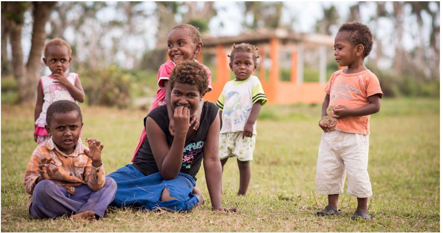
Epau, Vanuatu: A group of pikinini (children) watch Oxfam activities.