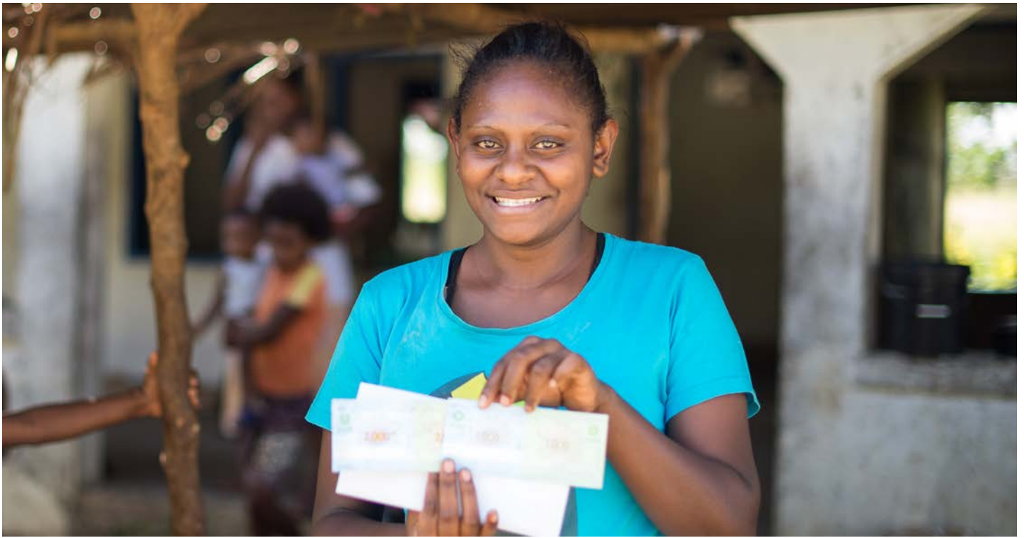
Oxfam has been distributing vouchers to families affected by Cyclone Pam. The vouchers can be exchanged at specific local stores and suppliers for items farming and building materials, and other general goods. The aim is to help them rebuild their livelihoods and grow food.