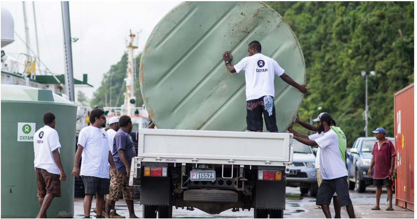
An Oxfam team unloads a water tank from a truck. Tanks were loaded onto the Greenpeace ship Rainbow Warrior to be transported to Epi Island. Oxfam has partnered with Greenpeace to help with water provision to the outer islands as part of Oxfam's emergency response to Cyclone Pam.