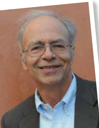
PETER SINGER PHILOSOPHER, ETHICIST AND OXFAM SUPPORTER

“I truly believe that leaving a gift in your Will to Oxfam is one of the best investments you can make to help create a world without the injustice and unnecessary suffering of poverty. And it’s your chance to create a world you’d want the young people of tomorrow to grow up in.”