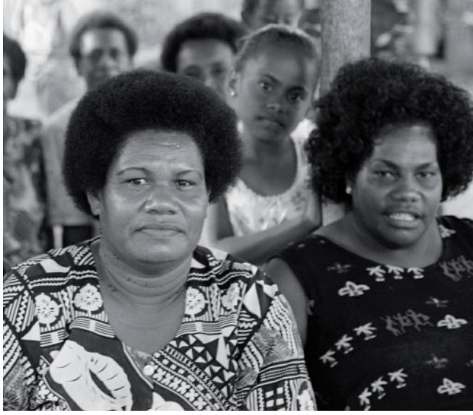
Women attending a community meeting express their grievances with the owners of the Vatukoula mine in Fiji.

This report presents a gender impact assessment framework to help assess and then avoid the potential negative gender impacts of a mining project. This framework should be adapted as necessary for the specific situation or context and is summarised below.