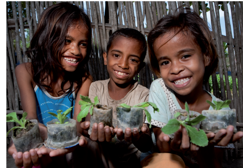
Children with seedlings; Covilima, Timor-Leste. The COPE for LIFE project aims to support the empowerment of women and men in Covalima and Oecusse Districts to increase food security and to improve, diversify, sustain and replicate strategies for more secure livelihoods.

During 2009–2010, we funded long-term development and emergency response work in eight regions around the world. In some countries we work through locally-based partners or directly with the community; in other countries we work through another Oxfam affiliate.