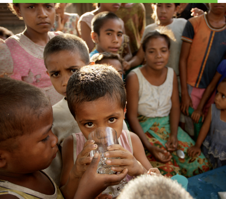
TOP: Nong Por Village, Feaung District, Vientiane Province, Laos. Oxfam Australia has built a new primary school in the village, which saves children from having to walk over a mountain to a nearby village to go to school. March 2006.